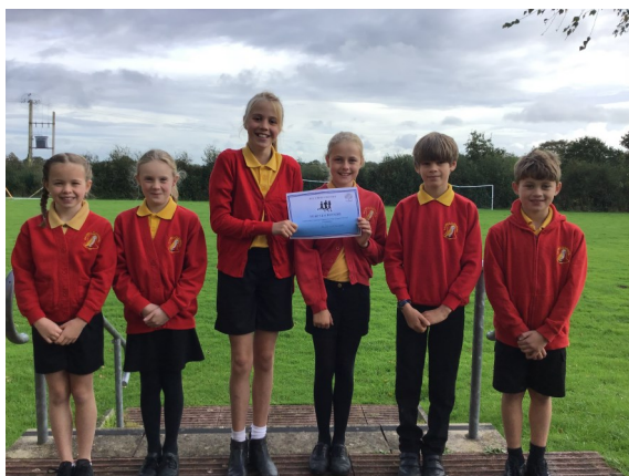
Y5/6 top 10 positions