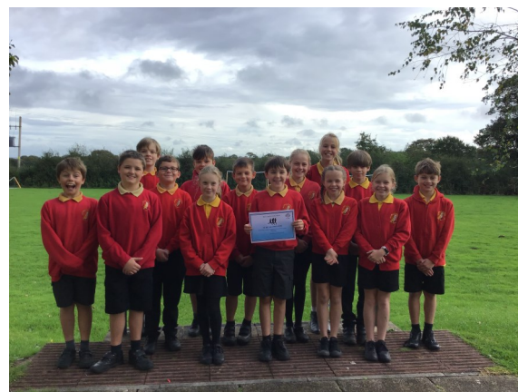
Y5/6 were overall Winners!