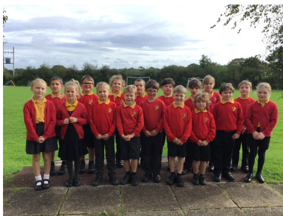
Y3/4 were the Runners Up in the competition.