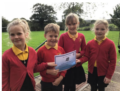
Y3/4 top 10 positions